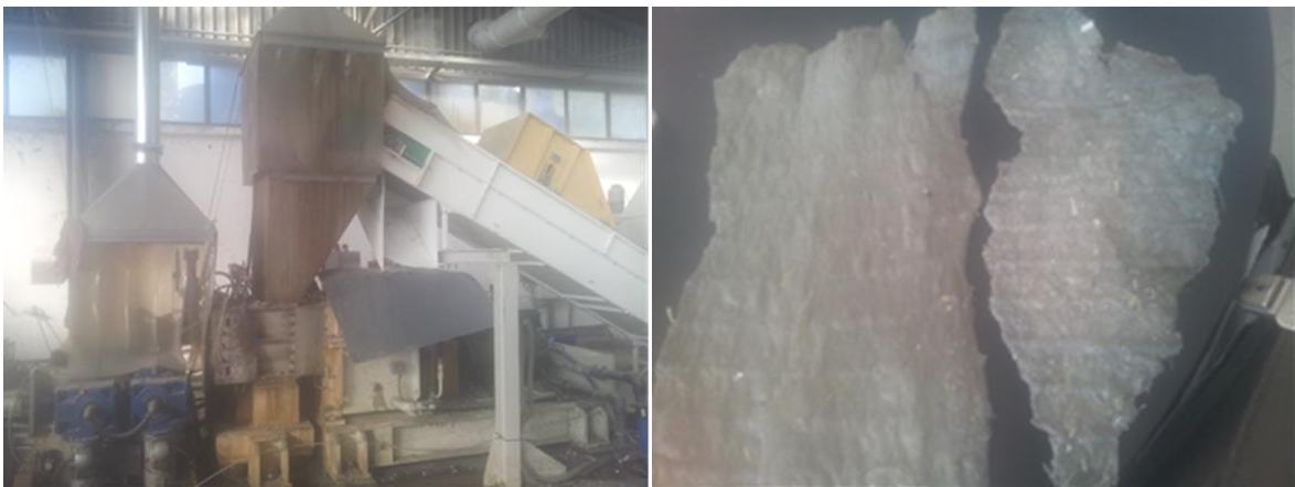
Figure 2: Plastic densification process (left) and densified plastic material made of pulper waste (right)

Hereafter, a couple of pictures taken during test trials are reported, concerning a machine for plastic densification and the densified plastic material coming from pre-treated pulper.