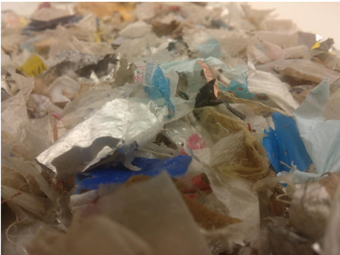
Figure 1: Details of pulper waste after dry-cleaning